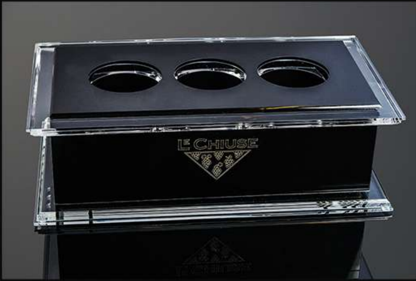
3 place bottle holder