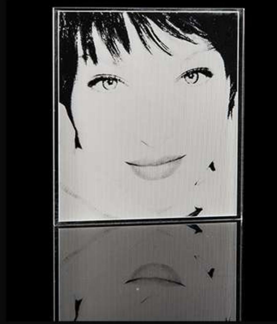
Laser rasterized image