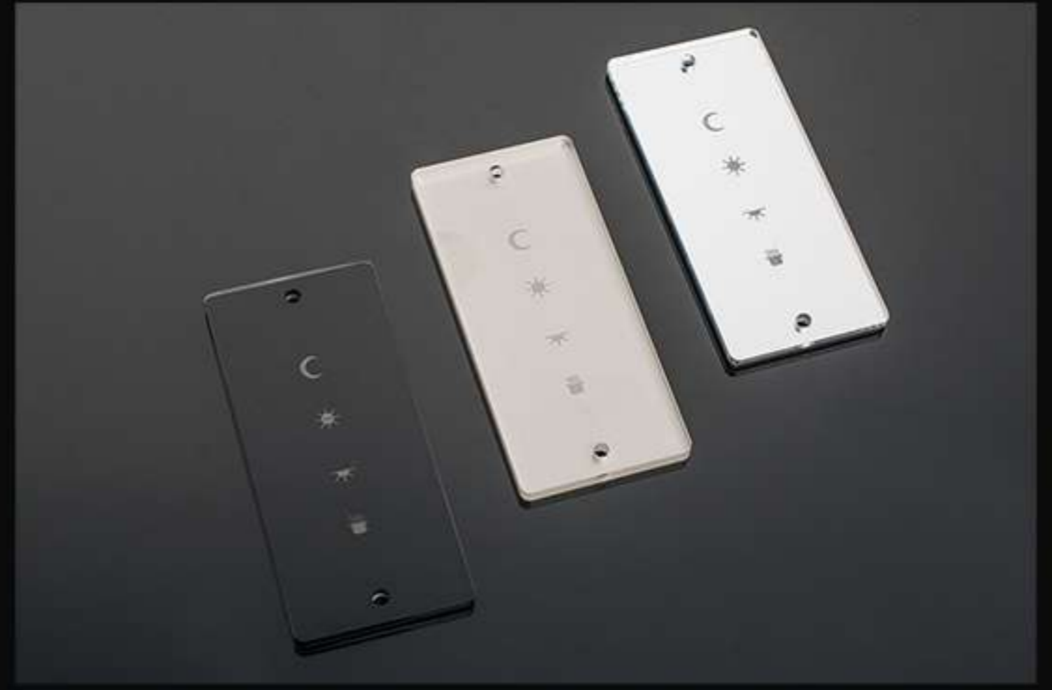
Plate for touch keypad